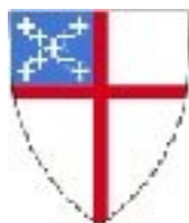
The Episcopal Church