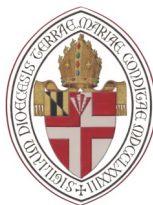
Diocese of Maryland

"St. James', a parish rooted in its witness to Christ, is a welcoming Episcopal Community—open in spirit, deep in faith, rich in worship, and active in service."