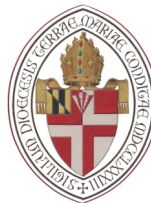
Diocese of Maryland

"St. James', a parish rooted in its witness to Christ, is a welcoming Episcopal Community—open in spirit, deep in faith, rich in worship, and active in service."