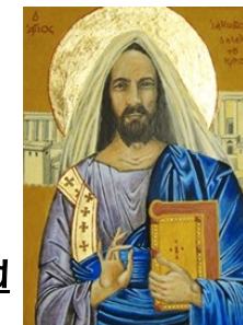
St. James of Jerusalem

We encourage every member to make a pledge of financial support to the parish. Offering such a pledge is a requirement for serving on the vestry.